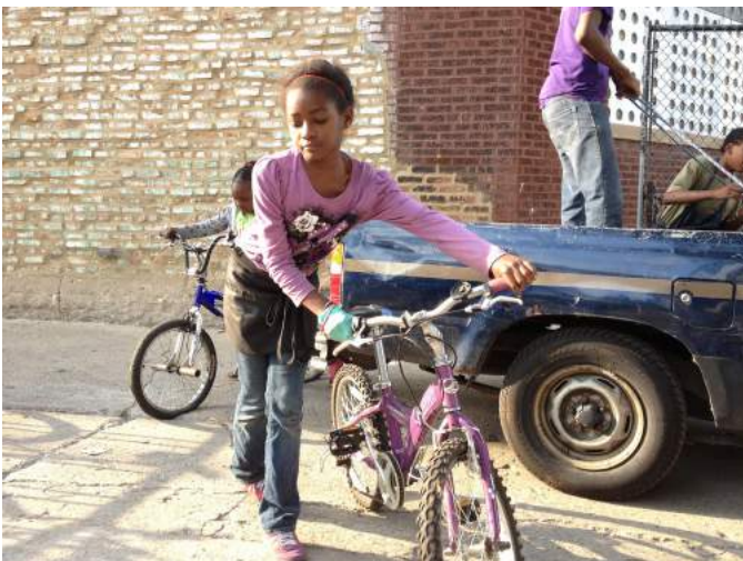
Volunteers pack up shipping containers earlier this year.