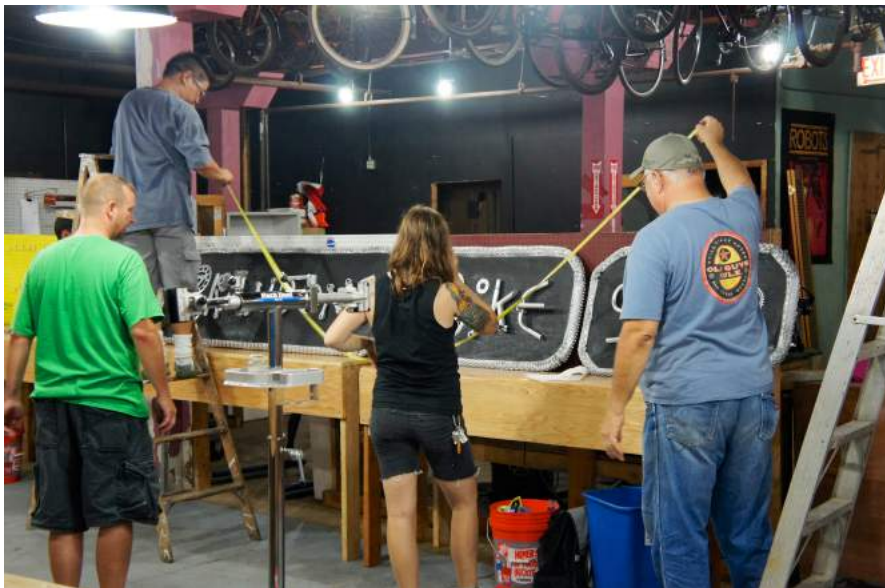
Volunteers put the final touches on Brandon's Bike Shop in August.