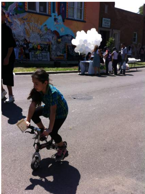
Kids give our "circus bikes" a try at Universidad Popular's Paz en mi Barrio Block Party, August 17.