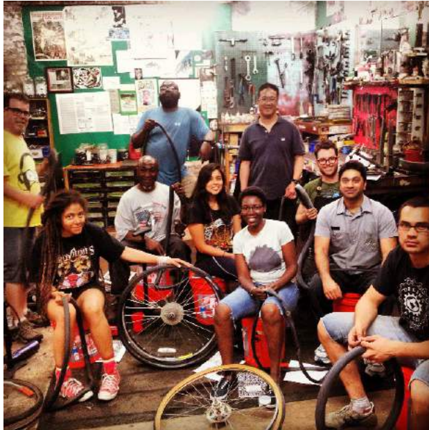
Students of our first “instruct the instructor” class in spring of 2013, prepping future bike education program leaders.