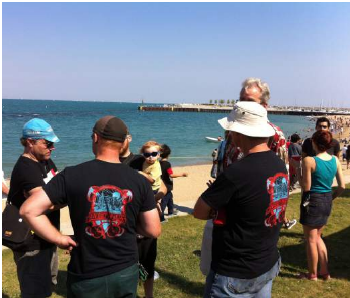
Working Bikes staff and volunteers enjoy the sun at our end of summer bbq at Chicago's 31 st Street Beach.