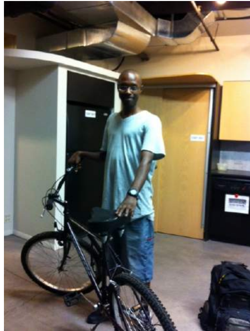
Two local donation recipients with their brand new-old bikes.