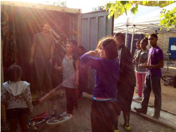
Volunteer Yadid helps deliver kids bikes to Blackstone Bikes.