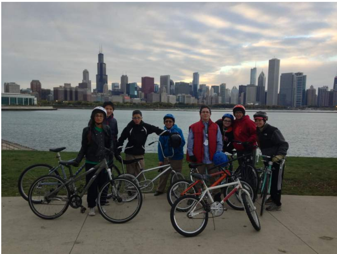
Our IHSCA afterschool bike class on a long ride to Lake Shore this past fall.