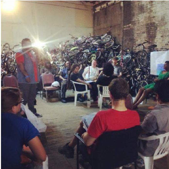
Attendees of an Understanding Adulthood workshop facilitated by the Chicago Freedom School escape the heat on the slightly-cooler shipping dock in late May.